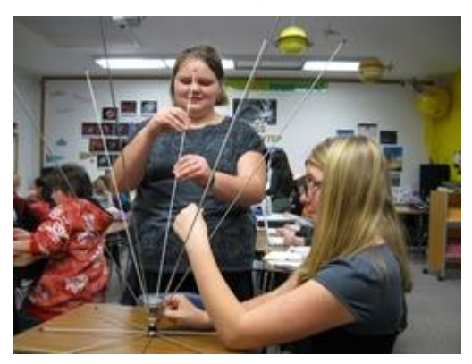
Students work on an antenna.

Elementary School in Lana'i City, Hawaii, will attempt the contact between March 20 and 24, 2023. Students attending the high school already study amateur radio and the research being done on the ISS, among other scientific pursuits.