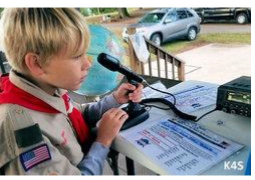
Special event station K4S in Jasper, Tennessee, 2018 photo; Radio Scouting.

behind it on the biggest gains list is the Electronics Merit Badge, which jumped 15 spots, from 80th to 65th. To earn the rank of Eagle Scout, members must earn 21 badges, 14 of which are standard. The Scout gets to choose the remaining badges based on personal interests.