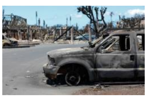
Damaged buildings and vehicles in Lahaina.

President Biden visited the island on Monday, August 21, 2023, and told residents the federal